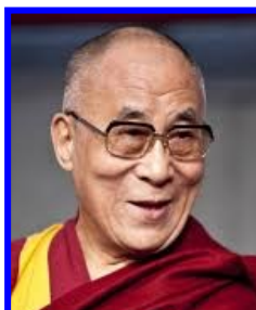
Dalai Lama Nobel Peace Prize 1989

"When educating the minds of our youth, We mustn't forget to educate their hearts"