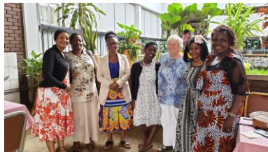
We hosted a lunch for some of the students and their families at the YMCA.