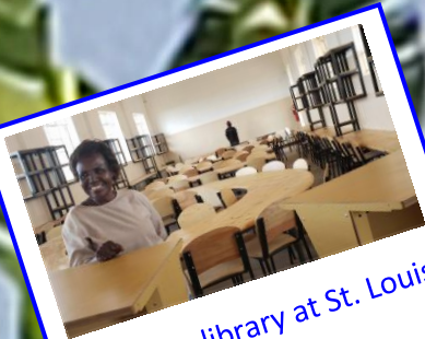
The new library at St. Louis Primary School. Fundraising for books is underway.